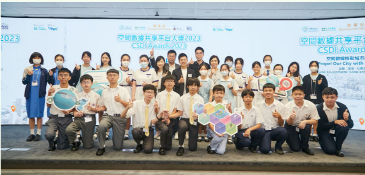
Awardees of Junior Secondary School Category (S1-S3)