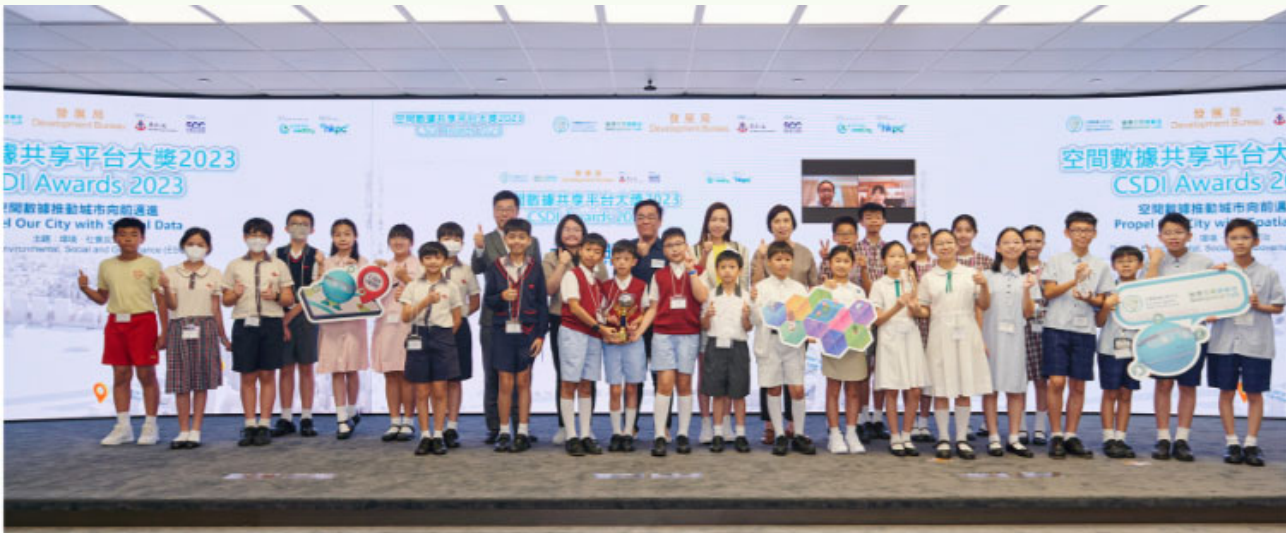
Awardees of Primary School Category (P4-P6)