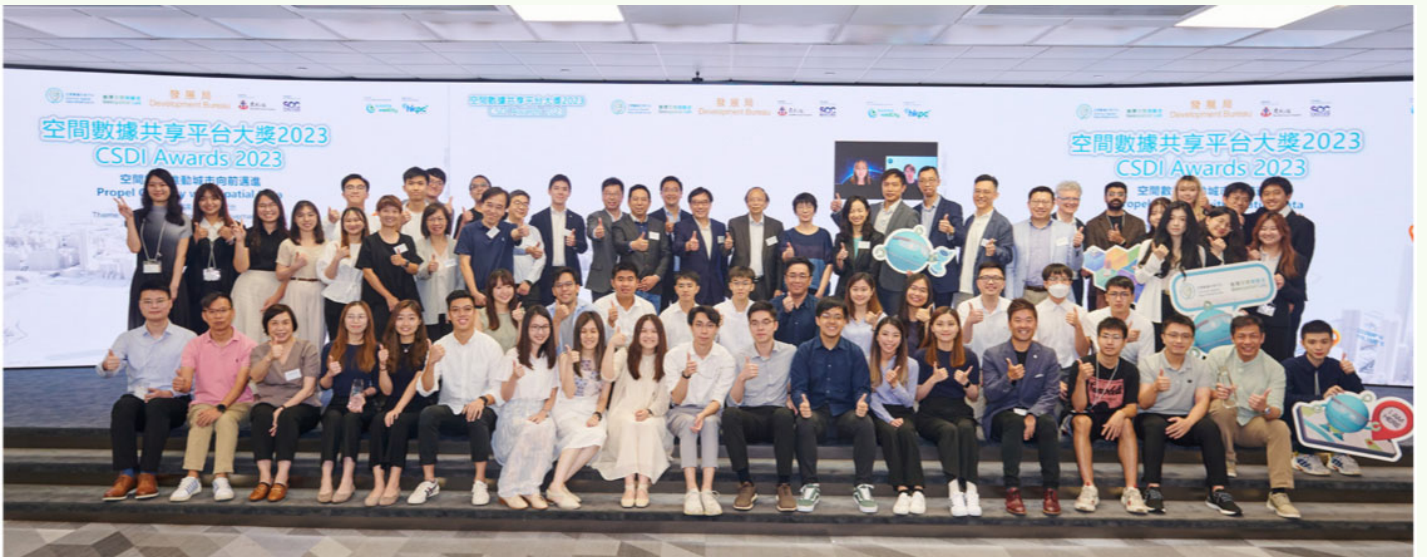
Awardees of Open Category