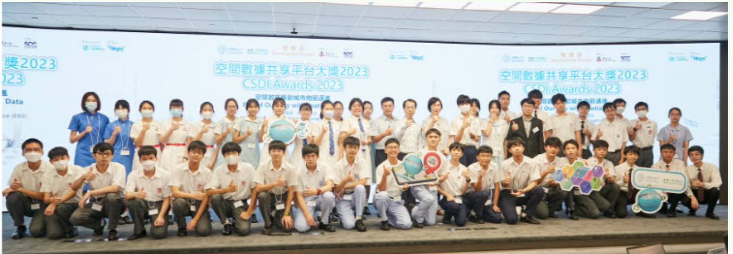
Awardees of Senior Secondary School (S4-S6)